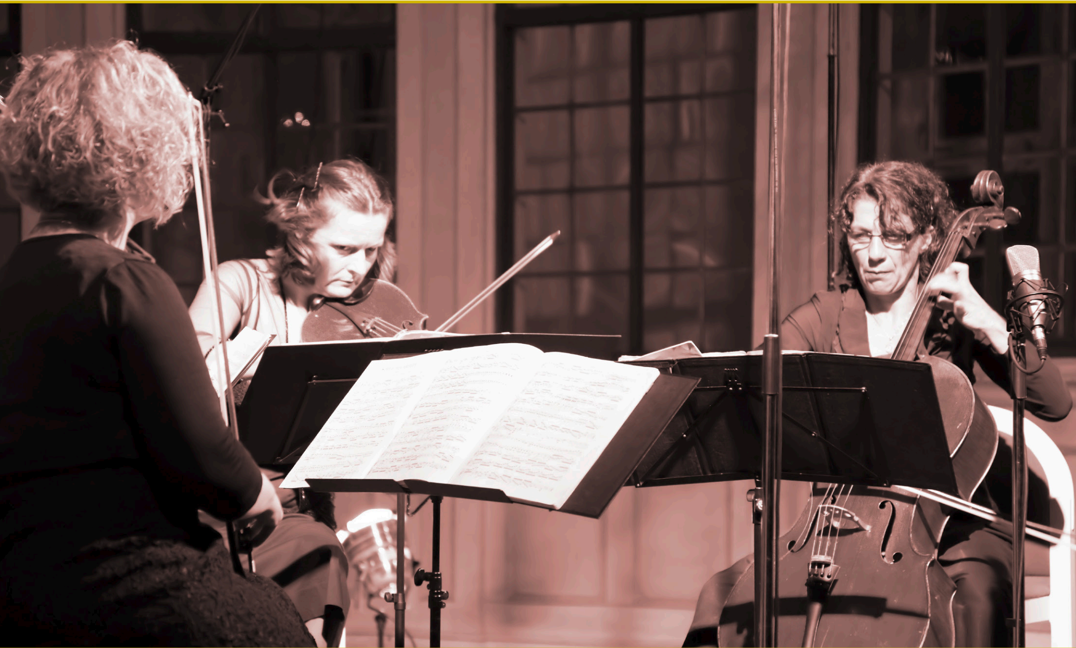
JOSEPH HAYDN ~ STRING QUARTET No. 63 - SUNRISE QUARTET