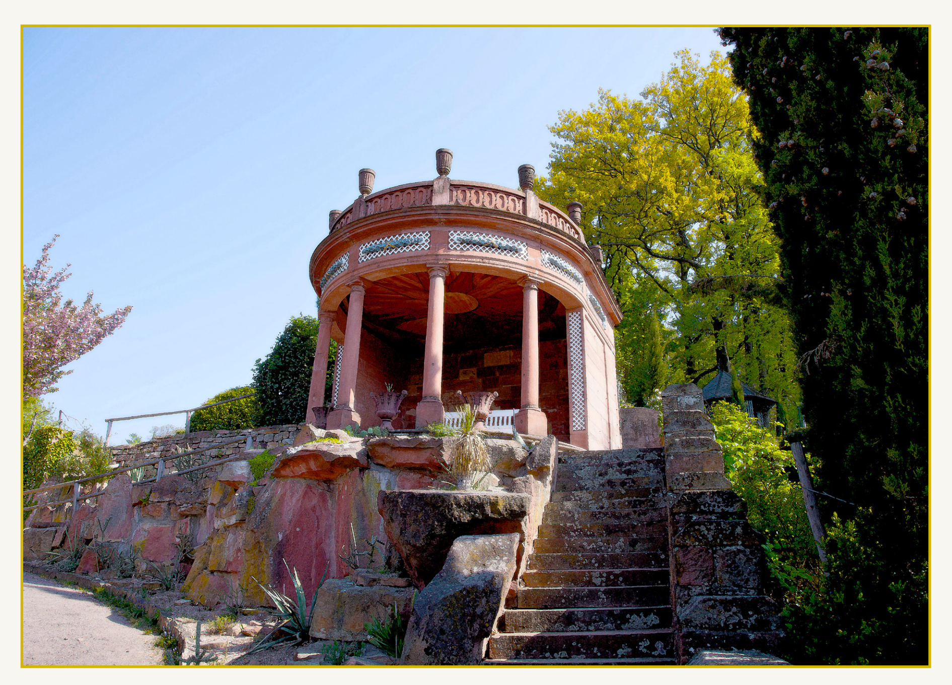
Grand Piano Masters ~ Wolfgang Amadeus Mozart - Piano Concerto No. 21